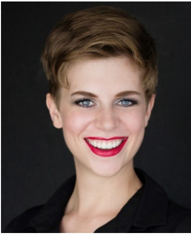
RB Kelly Body Language Boss

Rejection, awkwardness, embarrassment, frustration - these are emotions we face every day, but it doesn't have to be that way. Communication in the workplace is essential to performing tasks and working as a team. An awareness of your body language helps you assess the message you are sending your colleagues. There are revolutionary secrets out there.